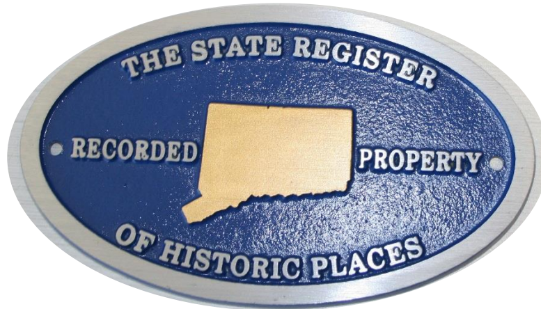
For properties listed individually or as part of State Register districts