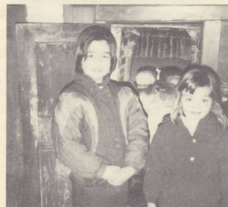
What it's all about...two of Branford's future enjoy a little of Branford's past.