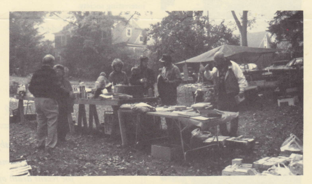
Be sure to join us for this year's Fall Festival and Tag Sale on October 17th!

You're invited to our popular Open House Holiday Party, on Sunday December 6 from 1:00 - 5:00 p.m. Come see the House in Yuletide decorations, a decorated tree to raffle, delicious punch and sweets, and your favorite music in the parlor.