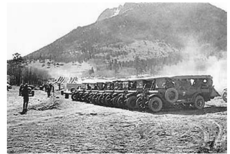
CCC Workers at Rocky Mountain National Park

The author and his wife raised their three children in an old farm house on the West Branch of the Delaware River in Delhi, New York. He taught reading for thirty-six years before retiring and has written books on the Catskill and Adirondack fire towers. He also writes a weekly newspaper column “Adirondack Stories”; 150 of these stories are now in book form.