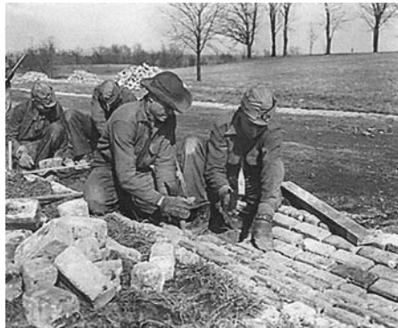
CCC Workers Constructing Road

The program topic is pertinent this year because 2008 marks the 75 th anniversary of the founding the CCC according to the speaker who resides in Colchester. The CCC began on March 31, 1933 under President Franklin Roosevelt’s “New Deal” to relieve the poverty and unemployment of the Depression. Camps were set up in many Connecticut towns,